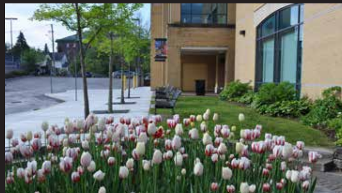
Tulips donated by Gloria Reszler to celebrate Canada 150